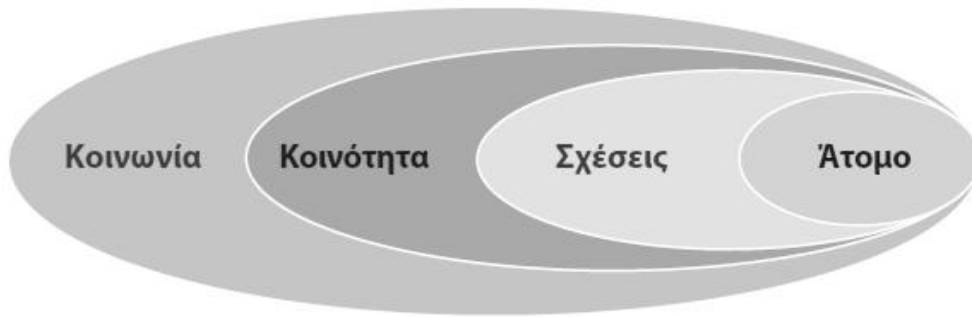
μ 1.1. World Health Organization, 2006.

Η Κοινωνία, η Κοινότητα, οι Σχέσεις και το Άτομο αποτελούν τα βασικά επίπεδα της υγείας. Η υγεία είναι μια κατάσταση ευεστρέφειας, στην οποία ο άνθρωπος μπορεί να αντιμετωπίσει τις απαιτήσεις της ζωής, να εργάζεται, να σπουδάσει, να απολαύσει την αλληλεπίδραση με τους άλλους και να συμβάλει στην κοινωνία. Η υγεία είναι μια κατάσταση ευεστρέφειας, στην οποία ο άνθρωπος μπορεί να αντιμετωπίσει τις απαιτήσεις της ζωής, να εργάζεται, να σπουδάσει, να απολαύσει την αλληλεπίδραση με τους άλλους και να συμβάλει στην κοινωνία. Η υγεία είναι μια κατάσταση ευεστρέφειας, στην οποία ο άνθρωπος μπορεί να αντιμετωπίσει τις απαιτήσεις της ζωής, να εργάζεται, να σπουδάσει, να απολαύσει την αλληλεπίδραση με τους άλλους και να συμβάλει στην κοινωνία.